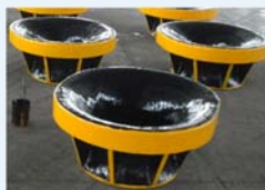
DK-ETS Mordec Towing Chock- Bulwark Mounted