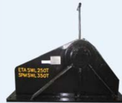
DK-ETS Mordec Chain Stopper- OCIMF