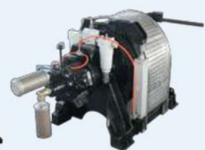
DK-ETS Mordec 3T Air Winch