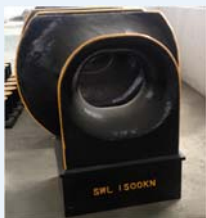
DK-ETS Mordec Towing Chock - Deck Mounted