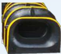
DK-ACP Mordec Panama Chock Single AC-ISO 13728 : SWL 45.36T