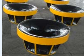
DK-ACP Mordec Panama Chock Single BC-ISO 13728 : SWL 45.36T