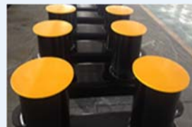
DK-ACP Mordec Double Bitt Bollard-ISO 13795 : SWL 64T and 90T