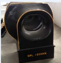
DK-SPM Mordec Towing Chock-Deck Mounted