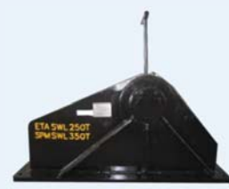
DK-SPM Mordec Chain Stopper-OCIMF