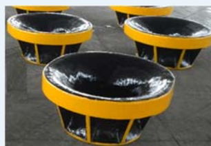
DK-SPM Mordec Towing Chock-Bulwark Mounted